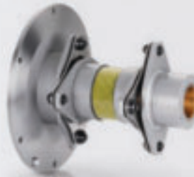
Couplings for wind turbines Pages 14–15