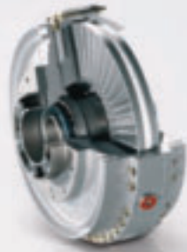
Fluid couplings Pages 12–13