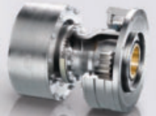
Couplings for railway vehicles Pages 16–17