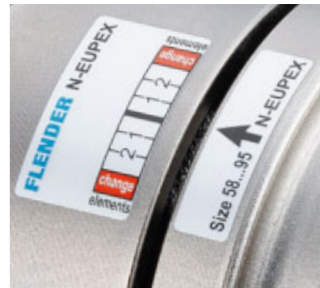
Simple examination of the condition of the flexible element in the N-EUPEX coupling by wear indicator.

We also offer many series covering special customer needs. In addition to couplings connecting flange and shaft, variants with brake disc or brake drum are also frequently required.