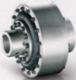
Highly flexible couplings Pages 10–11