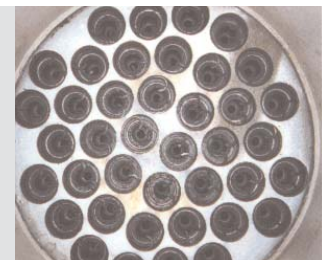
Cyclone clarifiers inside the vessel.